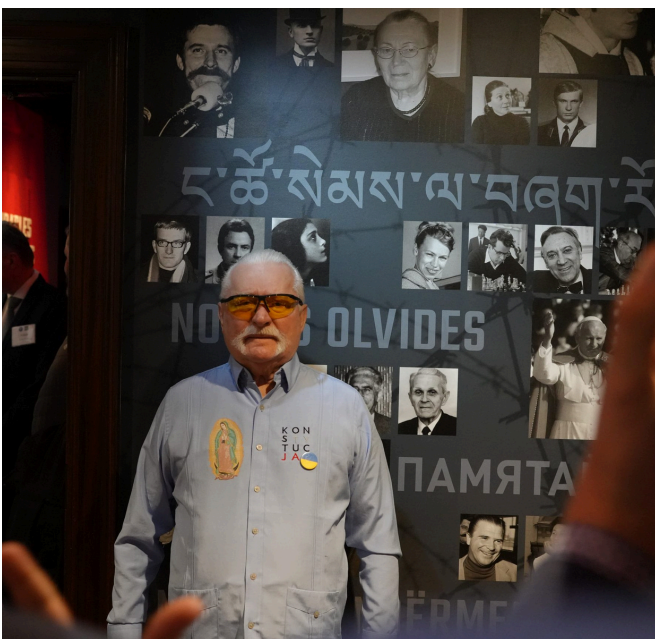
Lech Wałęsa stands in front of his own photo displayed on the VOC Museum’s “Remember Us Wall.”

Free Trade Union, which grew from a local movement advocating for workers’ rights into a revolution that united Poland against their totalitarian rulers and effectively toppled a brutal regime.