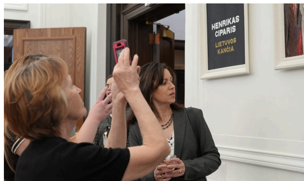
Above and right: Guests tour the exhibition at the opening event on March 15.