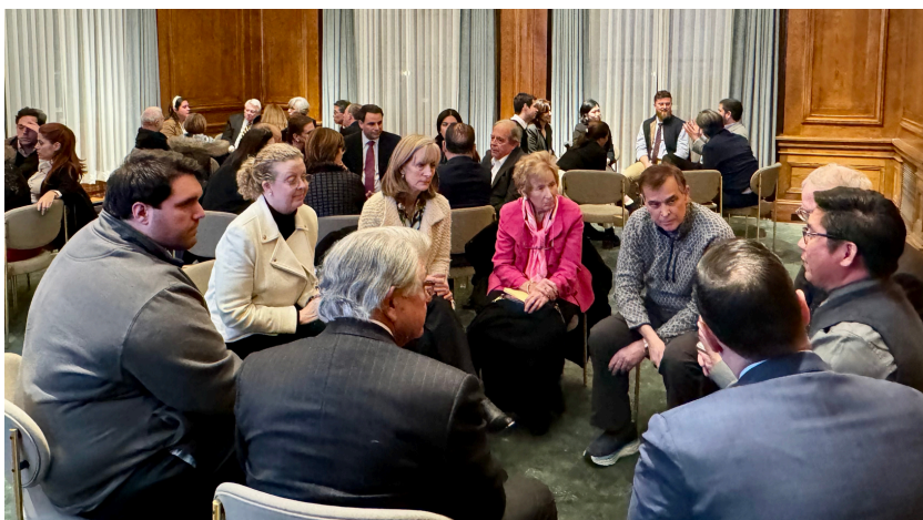
Witness share their personal stories during roundtable discussions.