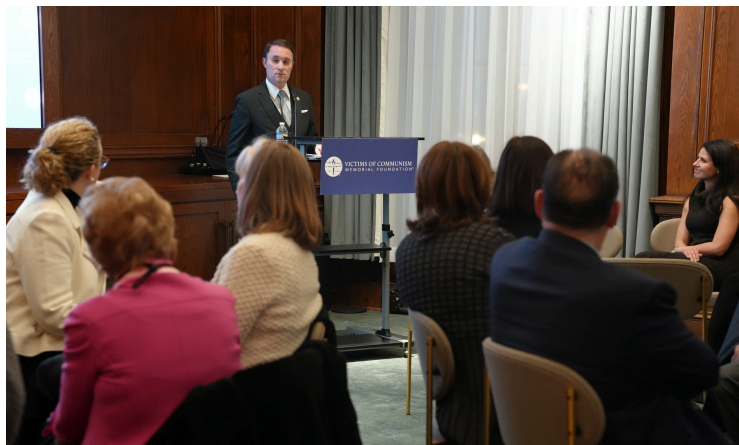
Virginia Attorney General Jason Miyares gives the keynote address.

—Jason Miyares, Virginia Attorney General